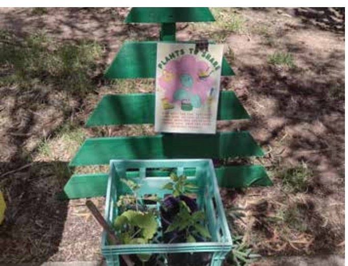
Top: Photo of a Grow Free cart in the North Eastern Suburbs Bottom: A photo of the plant share library that is part of the Little Library on Lloyd