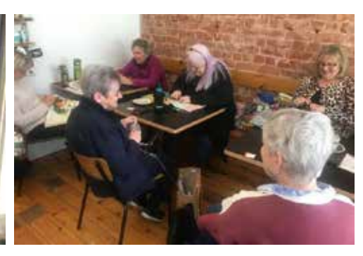
The knitting and crochet club

"Inclusion is everyone's responsibility" - Annemijn