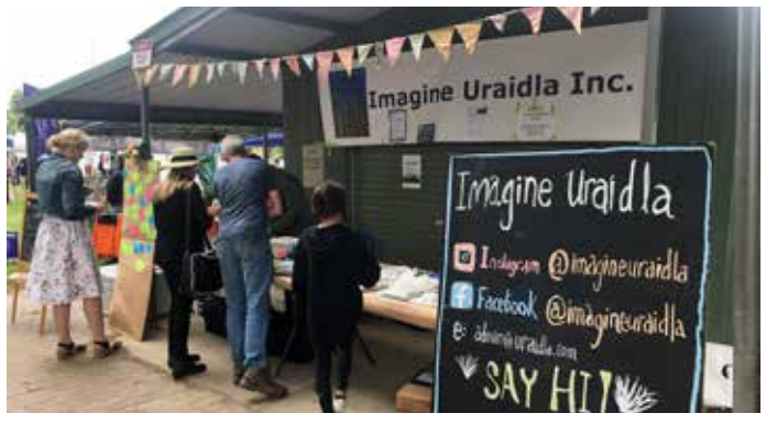
A photo of the Imagine Uraidla stall at the sustainability fair where they ask for feedback from the community.